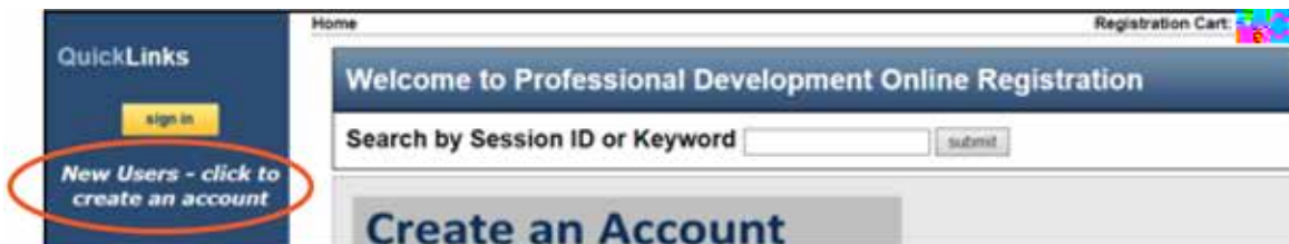
Fig 1. Image clip of QuickLinks new users registration page